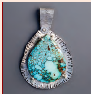
Karen's creations: Polyhedroid agate set in silver and brass. Turquoise set in silver with antique finish.