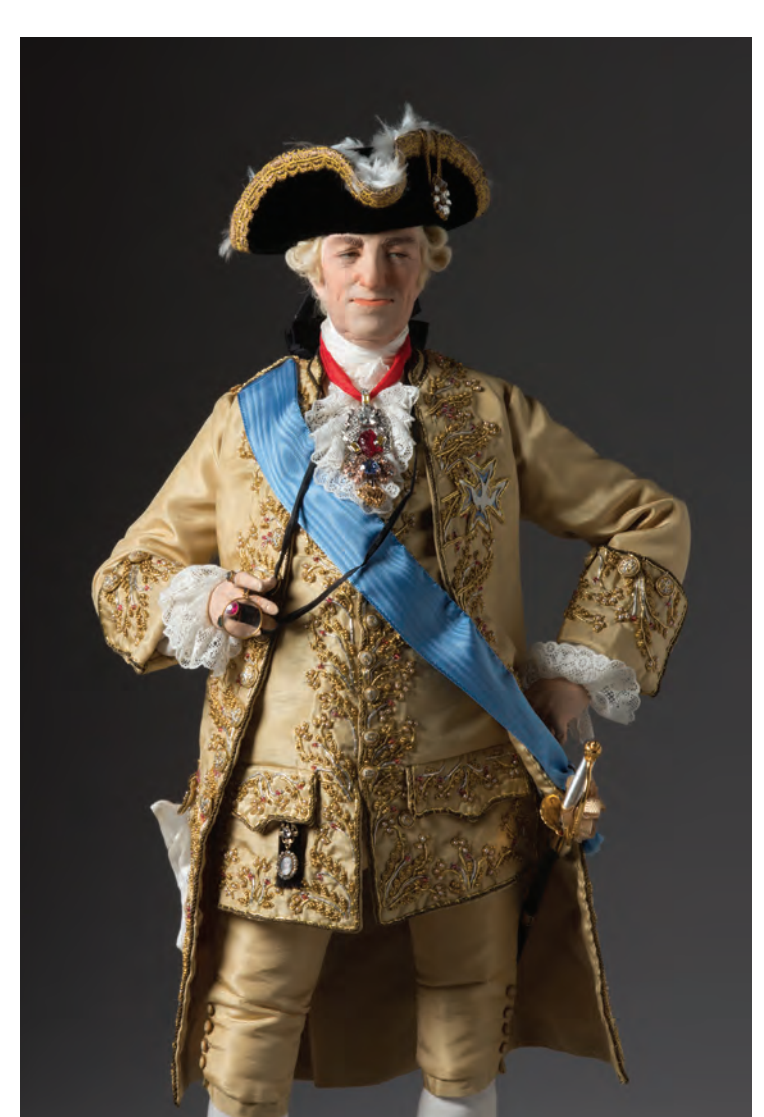
In 1749, Louis' descendant, King Louis XV, had the French Blue set into a more elaborate jewelled pendant for the Order of the Golden Fleece. The assembled piece included a red spinel of 107 carats shaped as a dragon breathing "covetous flames", as well as 83 red-painted diamonds and 112 yellow-painted diamonds to suggest a fleece shape. The piece fell into disuse after the death of Louis XV. The diamond became the property of his grandson King Louis XVI.