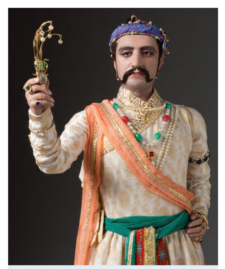
The Shah Jahan holds the turban ornament containing the Great Table Cut diamond. Taken as plunder by an Iranian Mogul, the diamond disappeared, although there is some evidence is still exists.