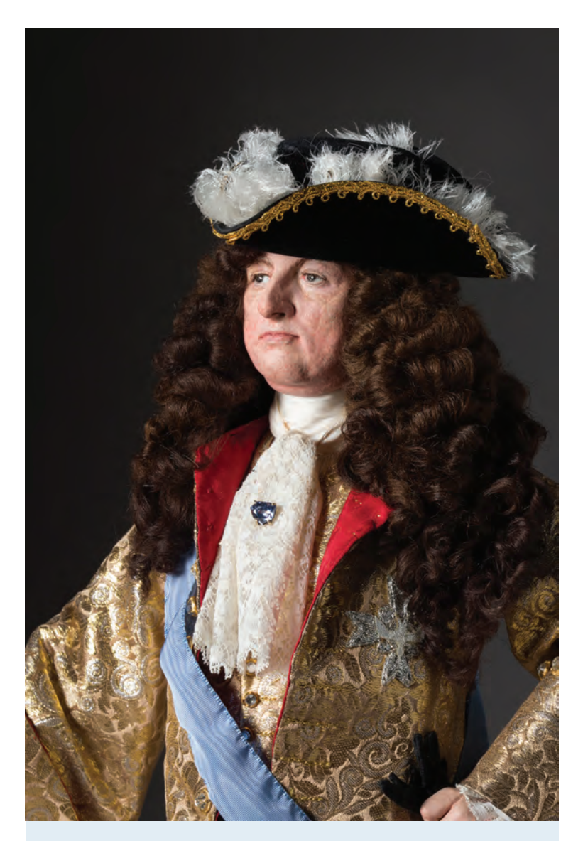
The Sun King, Louis XIV kept the Tavernier Blue diamond in his cabinet of curiosities until deciding to recut it for his apparel. In 1678, Louis XIV commissioned the court jeweler to recut the Tavernier Blue, resulting in a 67.125-carat stone which royal inventories thereafter listed as the Blue Diamond of the Crown of France. Later English-speaking historians have simply called it the French Blue. The King had the stone set on a cravat-pin.

The special exhibition "Legendary Diamonds" opens on June 27 and will be on display through January 3, 2016. The vignettes feature 9 famous historical characters from India, to France, Russia and the United States. If you have a group of 8 or more and would like to schedule a personal tour, please call the Museum for reservations.