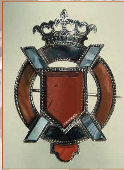
St. Andrew's Cross