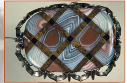
Clan Tartan Pin

The folk jewelry of Scotland, also known as Scottish Pebble and Cairngorm jewelry is unique. It is an important lapidary art form and it is historically significant. From a lapidary standpoint, the jewelry is easily recognizable by its Scottish symbolism, indigenous Scottish stones and exquisite silver work. From a historical viewpoint, the jewelry was so fashionable by the mid-nineteenth century that it spread across Europe and was made in different countries. It was popular and affordable.