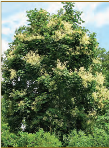
The Wutong tree

small fragrant, greenish-white flowers borne in large inflorescences. The flowering tree varies in fragrance with weather and time of the day, having a lemony odor with citronella and chocolate tones. The Wutong tree is a key botanical image in Chinese literature related to desirable human character and symbol of personality. Wutong wood is used in musical instruments like the Chinese zither.