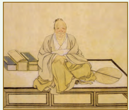
徐璋 18th century, Nanjing Museum.