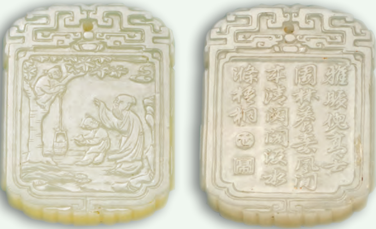
Ní Zàn Pendant The front side depicts two boys assisting Ní Zàn with cleaning the Wutong tree. The back side features a Ming fable written about the famous painter Ní Zàn.

This pendant honors the Chinese painter and poet Ní Zàn 倪瓚 (1301-1374) who lived during the Yuan and early Ming periods. The poem on the back side writes: with his esteemed name literati Ni; the Spring wind breezes in the garden; his work Qing Bi Ge 清閼閣; draw water to clean the tree called Wu Tong.