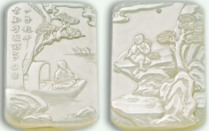
Eternal Friendship Pendant The front side shows Bó Yá playing the zither on a boat. The back side shows the woodcutter Zhong Ziqi sitting on the mountain.

There are two sides of the jade pendants that craftsmen would carve on: the front side presents scenes, patterns, or objects, while the back side is usually carved with poems or mottos. The contents of the front and back side echo mutually and deliver the same allegorical message. Because of its size and the auspicious meaning it carries, the jade pendant is very convenient to wear and ancient literati or aristocracy were fond of the small but exquisite pieces of jade. Let's look at two good examples from the Lizzadro Collection that refer to Chinese literature.