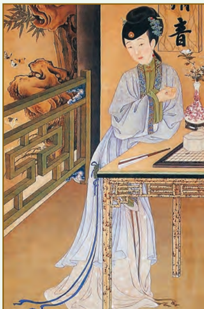
18th c., The Palace Museum collection, Beijing.

Pictured here is one of the paintings called “appreciating the butterflies in a summer leisure time” (消夏赏蝶 xiāo xià shǎng dié). The female figure is standing against a table, and we can observe a blue decoration from her waist.