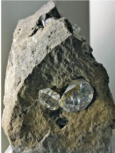
Herkimer diamonds in matrix

Quartz is the most common mineral on earth's crust and can be found in every kind of rock. Herkimers are formed only in sedimentary rocks, specifically in dolostone and limestone. Nestled within these 500-million-year-old rocks, are porous vugs. Vugs are cavities inside a rock. Many have heard of geodes. All geodes are vugs, but not all vugs are geodes. To be a geode, the cavity must be mostly spherical. Vugs need not be spherical, as long as there is a cavity present. The cavity in which Herkimers formed were created by subterranean marine deposits that were filled with mineral-rich liquid. As the liquid underwent tectonic shifts, heat and pressure caused crystal growth. The added pressure resulted in a somewhat symmetrical growth of the quartz crystals,