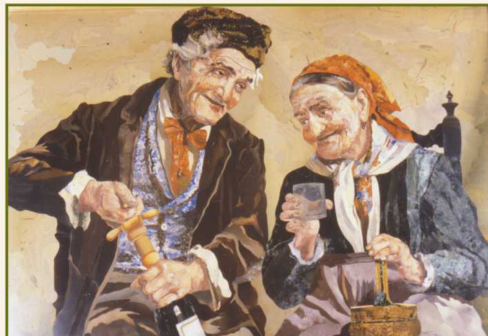
"Old Folks with Wine" 20 x 24 inches by G. Fiashi

This unique blending of popular figurative subject matter examined the world of the domestic peasant classes in Italy and became very popular. 19th century Florentine genre painters inspired and often collaborated with the pietra dura mosaic workshops in Florence that continued well into the 20th century.