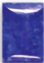
Lapis Lazuli is one of the Biblical stones used in Aaron's Breastplate.

Depending on the translation you read, and there are many different translations, these stones may be interpreted differently or found in a different place on the breastplate. All of the stones on the breastplate are believed to have been cut in cabochon form.