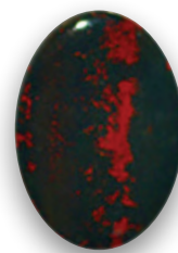
Bloodstone, also known as heliotrope, was named for the spilling of Christ's blood on green jasper during the Crucifixion.

Through the years changes have been made to our list of accepted birthstones resulting in some months having one or two alternate stones, as well as primary stones. Many of the Biblical stones still hold a position of primary or alternate stones. In some instances