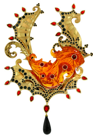
Synergy & Symbiosis piece "Pele's Mist."

Synergy & Symbiosis is on display from November 2 through April 27 th , 2025. The exhibit will be open Fridays, Saturdays, and Sundays. Entry is included in the price of Museum Admission, reservations for the exhibit are recommended.