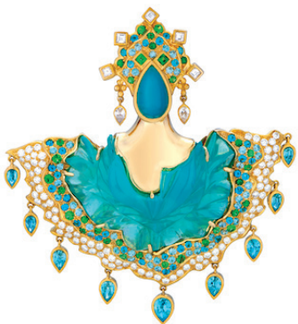
Synergy & Symbiosis piece "Georgia's Dream."