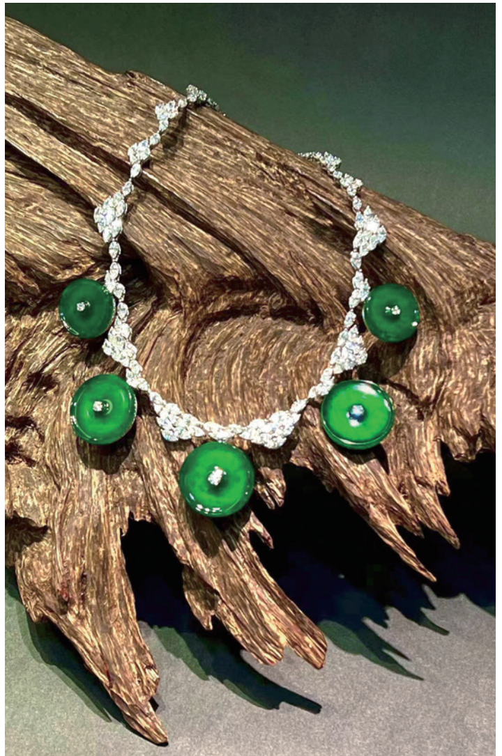
A few pieces of the fine Jadeite (Fei Cui) jewellery - imperial jade with vitreous luster - cut from the Royal Jade Boulder mined from the Sanka Mine in the early 1960s.