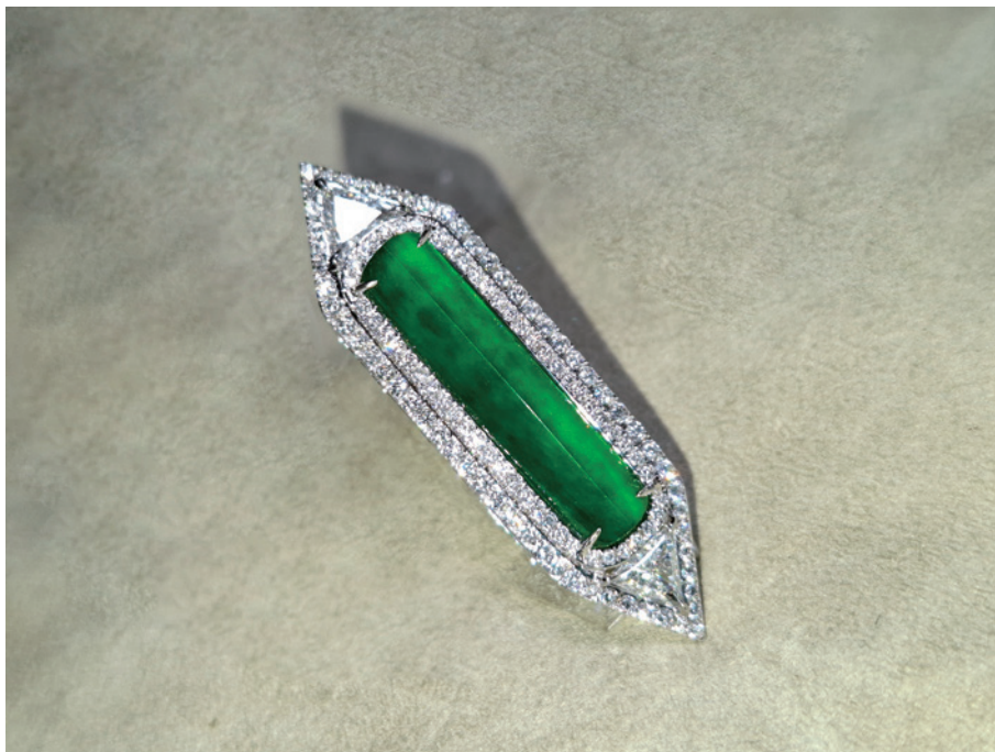
A jadeite jade brooch with unique triangular shape from the Lee family collection, of top "Imperial Jade" quality.