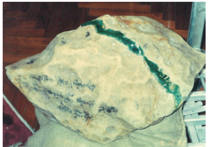
The Royal Jade Boulder, one of the milestone jadeite jade boulders of the Lee family, weighing approx. 61kgs.